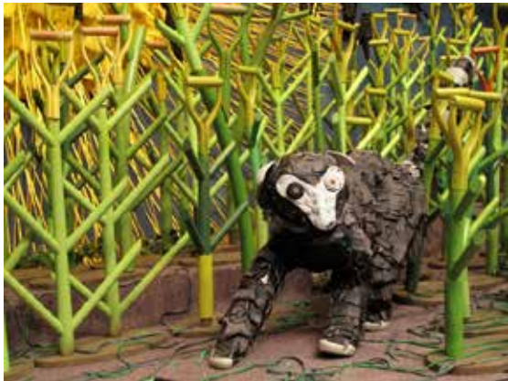
Mapache (Raccoon) , 2007, in Corn Field , 2011, Wooden shovels, bicycle tires, and shoes (on view October 6, 2016 – January 8, 2017)