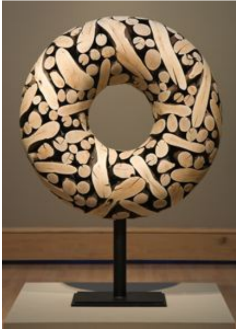
0121-1110=110012 (Standing Donut), 2009 Chestnut on painted steel stand