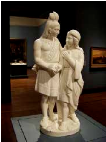
Hiawatha's Marriage , 1868 Marble