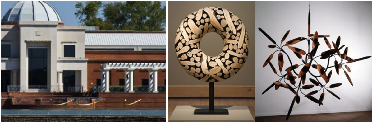
(Left) Edward Lee Hendricks 1991-IV , 1991, Stainless steel, gold leaf, and aluminum (Right) James Surls, I See Five and Nine , 1987, Charred redwood and painted steel

There are several other examples of abstract sculpture in and around the Museum in dialogue with nature. For example, the arcs in the lake could almost be a “solid gold” section of a ring . . . In the case of the arcs, the sculptures are not made of organic material such as the wood we see here but interact with light, wind, and water. The setting becomes a key part of the work, just as what we see through the center of Lee’s “donut” enhances it. I See Five and Nine , on the other hand, is composed of similar materials to Lee’s, including charred redwood and painted steel, with many pieces coming together to form a whole.