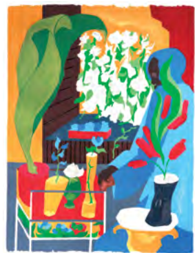
Jacob Lawrence, Supermarket—Flora 1996 , 1997, screen print, 35 x 26 3/4 inches, © Lincoln Center for the Performing Arts

In 1970, the List Collection broadened its scope by publishing its first signed and numbered print edition (by James Rosenquist), as a complement to the poster component. Since 1970, the List Collection has published four to six signed editions annually, making the List Collection print publishing program one of the oldest in the country in continual operation.